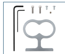
Aluminum stand kit